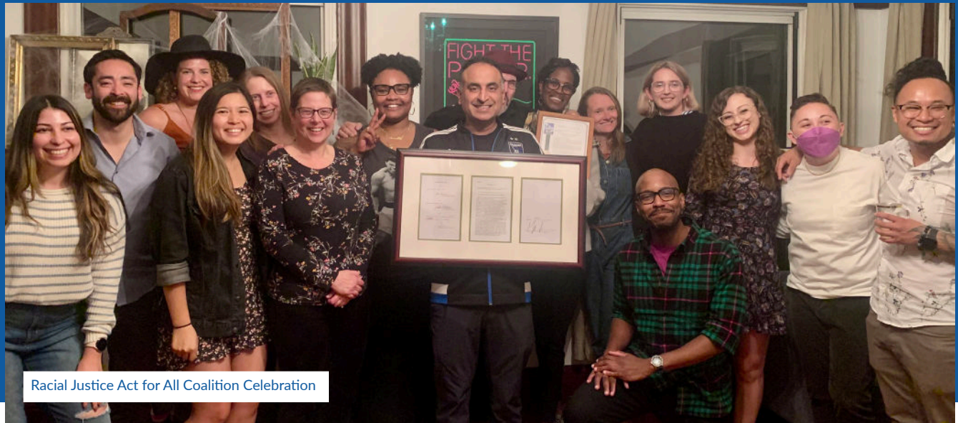
Racial Justice Act for All Coalition Celebration

In exciting wins for both housing and the environment, the LWVC supported bill AB 2011 (Wicks) which allows affordable housing to be built through a ministerial, streamlined process in commercially zoned districts, keeping development close to city centers to avoid sprawl and achieve greenhouse gas reductions. And AB 2097 (Friedman) ends parking mandates in many California cities, which is expected to lower housing costs and reduce pollution.